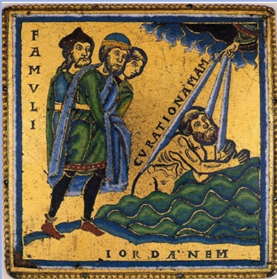
The Cleansing of Naaman in the River Jordan :: Proper 8, Year C (Meuse Valley, c 1150-1160)

www.standrewskentct.org * 860.927.3486 * st.andrew.kent@snet.net